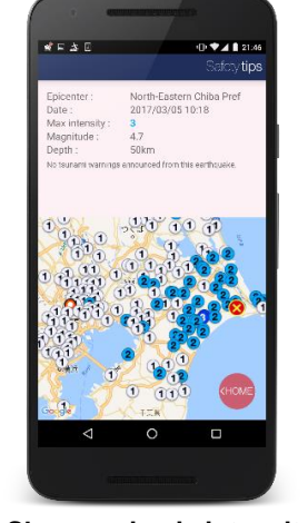
Shows seismic intensity of earthquakes in surrounding area

Provides visual representation of disasters' originating and current locations